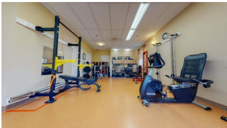
Physical Therapy Centre

Our Physical Therapy Team regularly visits residents to perform individual assessments and provide personalized care. They also offer walking sessions and group exercises to keep residents moving and engaged.