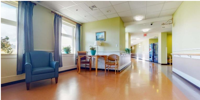
Meadowview Lane Alcove