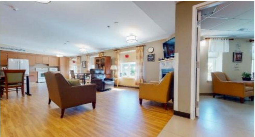
House Living Room

A comfortable seating area with a television, electric fireplace and garden view