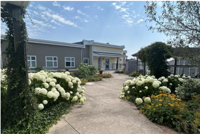
One of our six garden areas